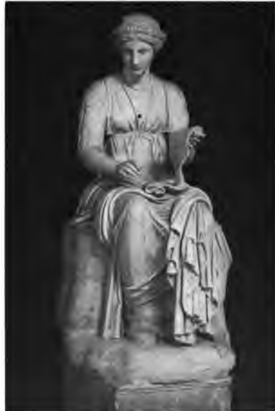
Fig. 36. Clio.

holds a lyre; Er'a to, the muse of love poetry, wears a thin garment and holds a lyre; Eu ter'pe, the muse of flute music, holds a double flute; U ra'ni a, the muse of astronomy, holds a globe; Po lym'ni a, the muse of religious poetry or the pantomime, is represented in an attitude of medi-